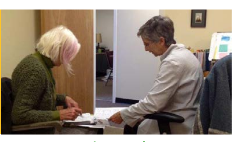
Information and Assistance

Central Vermont Council on Aging connects Vermonters with to a full range of coordinated programs, services, information and supports for independent living. In the past year, we have partnered with 1,344 seniors, and their families and caregivers to provide more than 1,242 hours of service to support seniors – that's an increase of 2,415 hours of service from the year before.