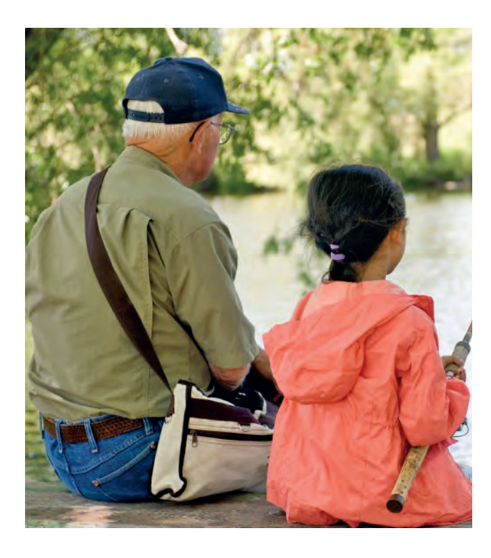
Supporting Central Vermonters to Age with Dignity and Choice